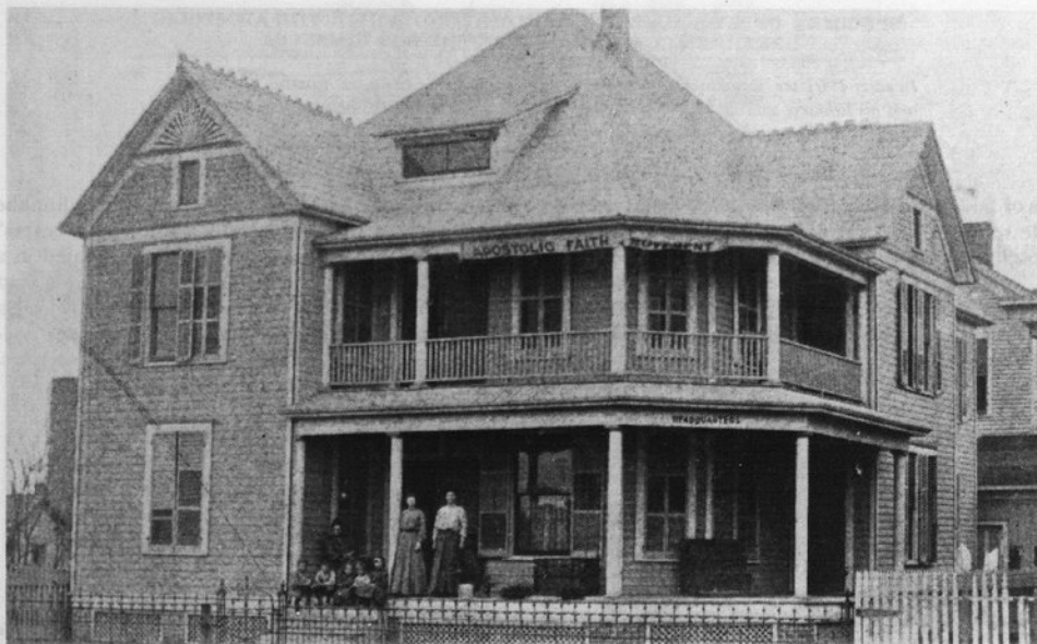
During the winter of 1905–6, Charles Parham's Bible school in Houston was held in this rented house, the "Apostolic Faith Movement Headquarters."