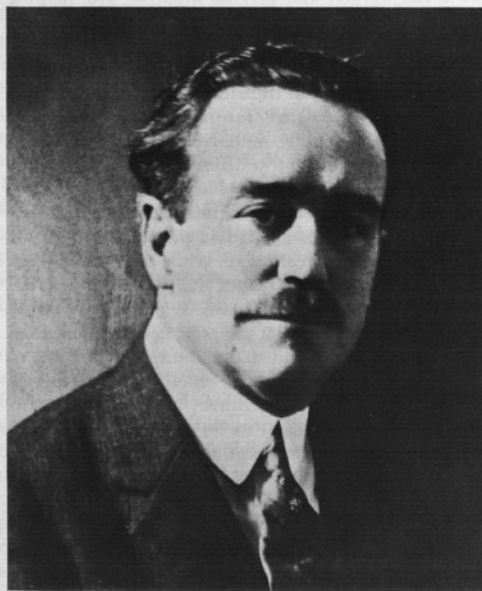
Charles Fox Parham

M ODERN pentecostal writers have described pentecostalism as "a movement without a man." 1 The absence of a clear-cut founder, partly a result of conflicting claims by early pioneers, has accentuated the belief in the movement's divine origins. In the words of one pentecostal historian, "Pen-