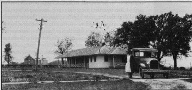
This 1930 view of the American Indian Institute in Wichita shows the campus looking south.

institute, was appointed to organize and head a ten-member research team in late 1926. 23