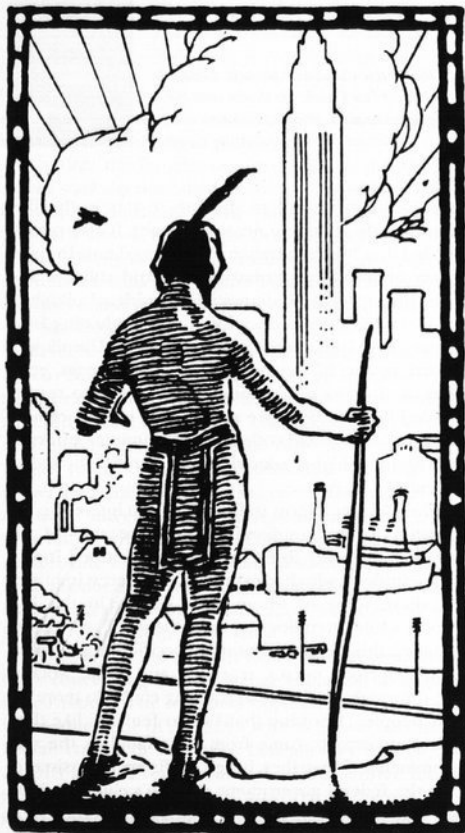
This drawing, combining a traditional white view of the American Indian with a scene of economic growth in early twentieth-century America, appeared on the back cover of an American Indian Institute pamphlet that was intended to raise funds for the school. Accompanying text stated that as part of the institute's "vision of the future" graduates would be "... a force for the conservation of the truest of Americanisms,—the aboriginal American."