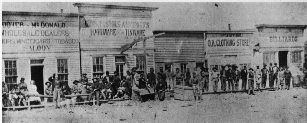
When this photograph of Front Street was taken in 1873, Ford County had been recently organized with Dodge City as the county seat. By 1876 and the coming of the cowtown period, court and law enforcement systems were firmly in place with "attractive vices" still accepted for their economic importance.

the requirements of preserving correct rules and form. If cases were decided in much shorter time than today, the speed reflects more on the nature of the docket than on hasty and erratic procedures. Obviously, there have been changes in form and practice over the years, but the decorum and basic rules in important matters are not greatly different. Today's lawyers would not feel terribly uncomfortable in the Dodge City district court of the 1880s; nor would they find the language of the court profoundly changed.