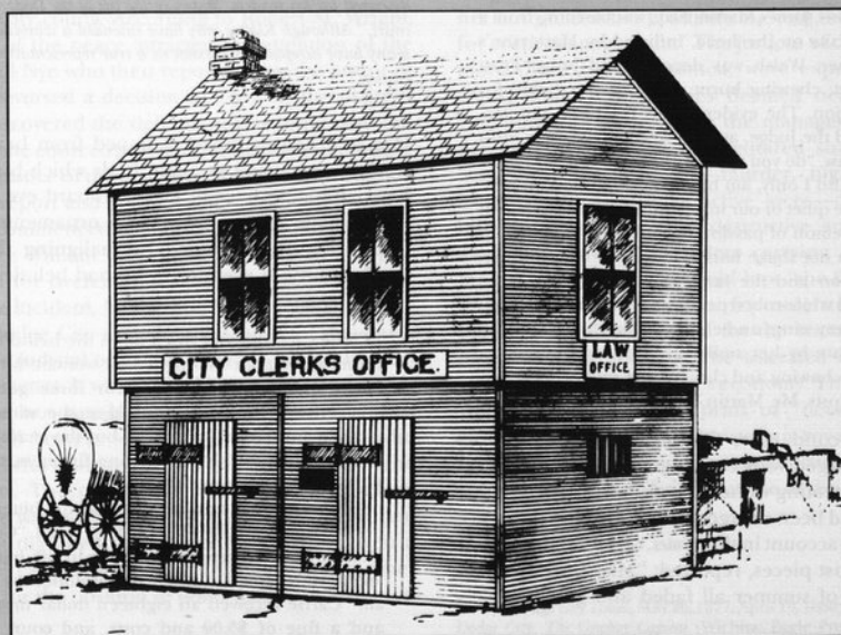
The "splendid jail" in the basement of Ford County's new courthouse (constructed 1876) was a marked improvement over the city's earlier wooden-plank jail.