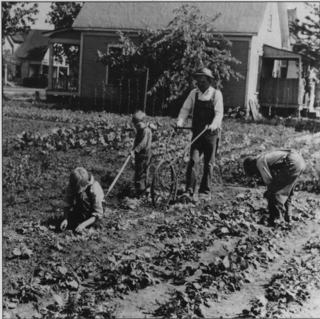
Victory Garden, Wichita, Kansas, 1942.