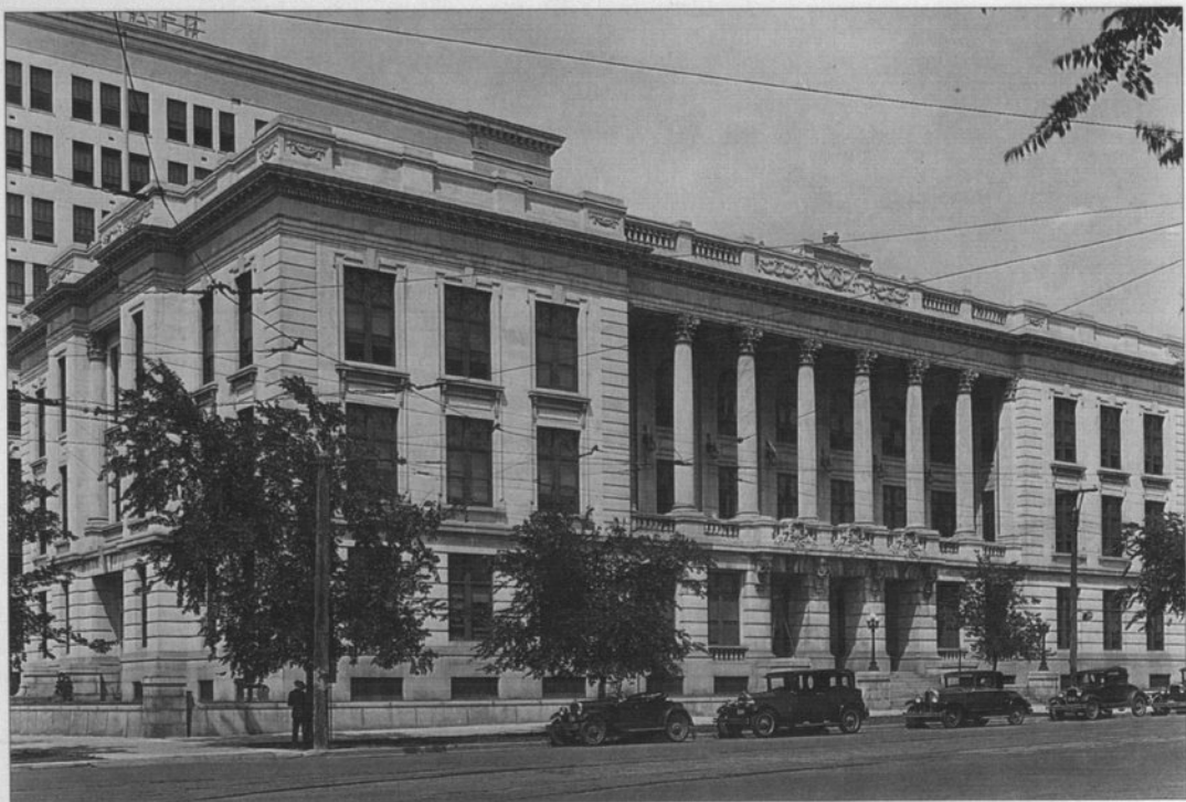
Memorial Building, headquarters of the Kansas State Historical Society, Topeka, 1920s.

"I believe we should erect a fine building, one that will be to this state what the congressional library is to the federal government."