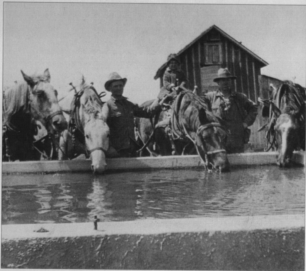
Unidentified farm in Sherman County, 1910s.

"On the Smoky and Beavers water can be secured at from 10 to 60 feet, and on the higher divides at the average depth of 100 feet," boasted the Sherman County Immigration Association in its 1893 publication Sherman County, Kansas . "The supply is abundant and the quality is splendid, clear as crystal and entirely free from all deleterious substances. There is little difficulty in securing, at modest cost, a good well, as parties make a specialty of putting down both bored and tubular wells, while the wind mill furnishes the power. A good well and wind mill can be secured at from $75 to $150, with a tank for the watering of stock. The water supply is inexhaustible, and a good well never runs dry, regardless of whether the season is wet or dry. A Niagara of water flows ceaselessly under all the country."