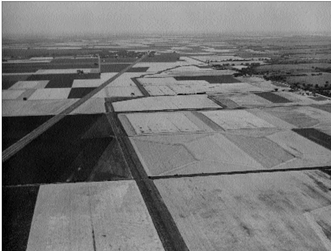
An "over" view of Kansas: wheat fields as far as the eye can see.

was 60 percent complete, ahead of its usual schedule. In the four or five days punctuated by my flyover of the harvest, Oakley area grain elevators took in 3.5 million bushels of wheat. This was out of a total harvest of 433.2 million bushels, the wheat some of the best in years—low moisture, high protein, and 37 bushels per acre on 11.4 million harvested acres. That’s as many acres as there are in all of Vermont and New Hampshire: imagine those two states as one big wheat field. Or imagine that if the harvested acres of wheat in Kansas made up the land area of a state, that state would be bigger than any one of these nine states: Connecticut, Delaware, Hawaii, Maryland, Massachusetts, New Hampshire, New Jersey, Rhode Island, Vermont. So wheat is important in Kansas; the state deserves its common nickname: Breadbasket.