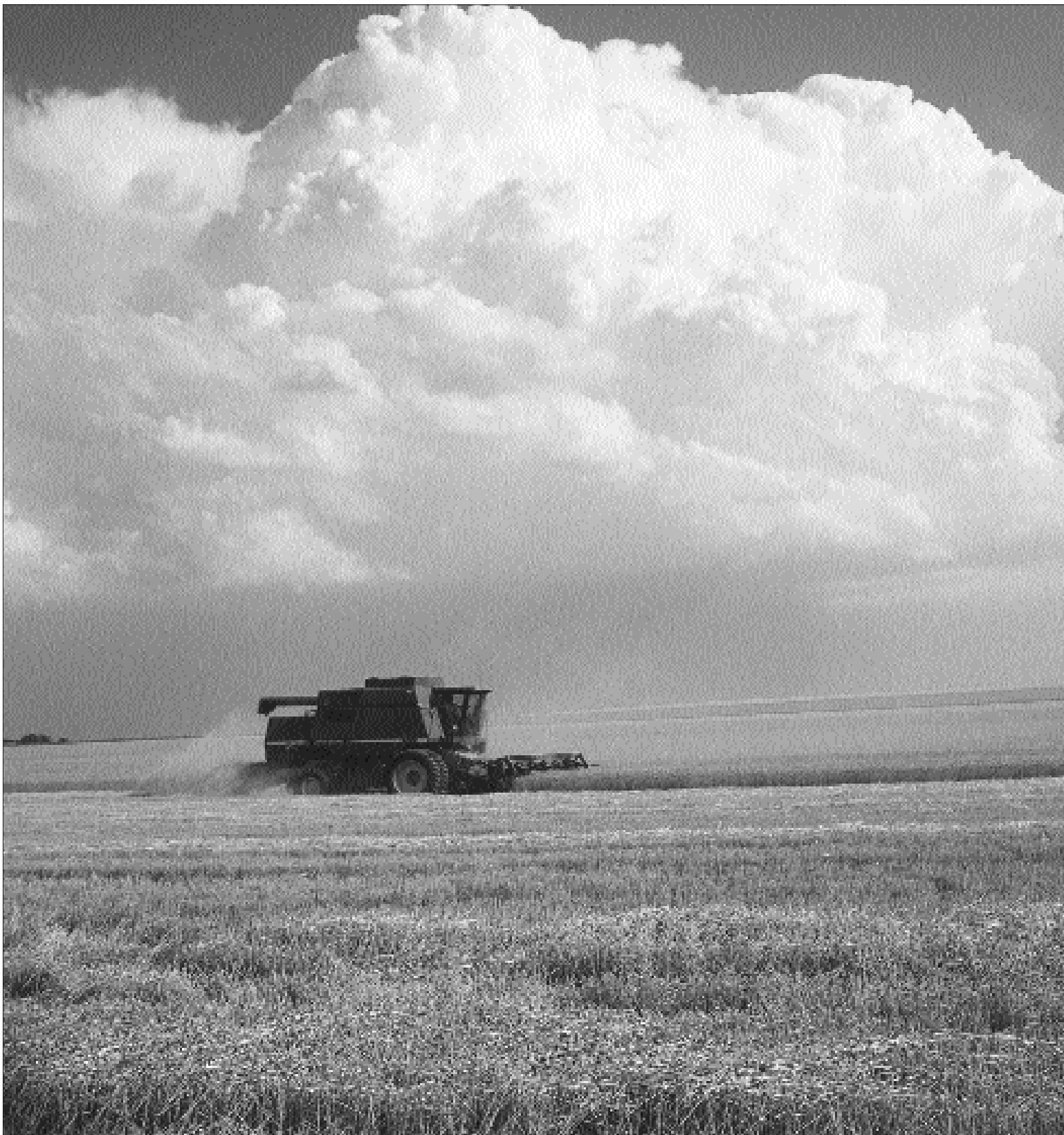
Harvest, Busse farm, Cheyenne County, 1998.