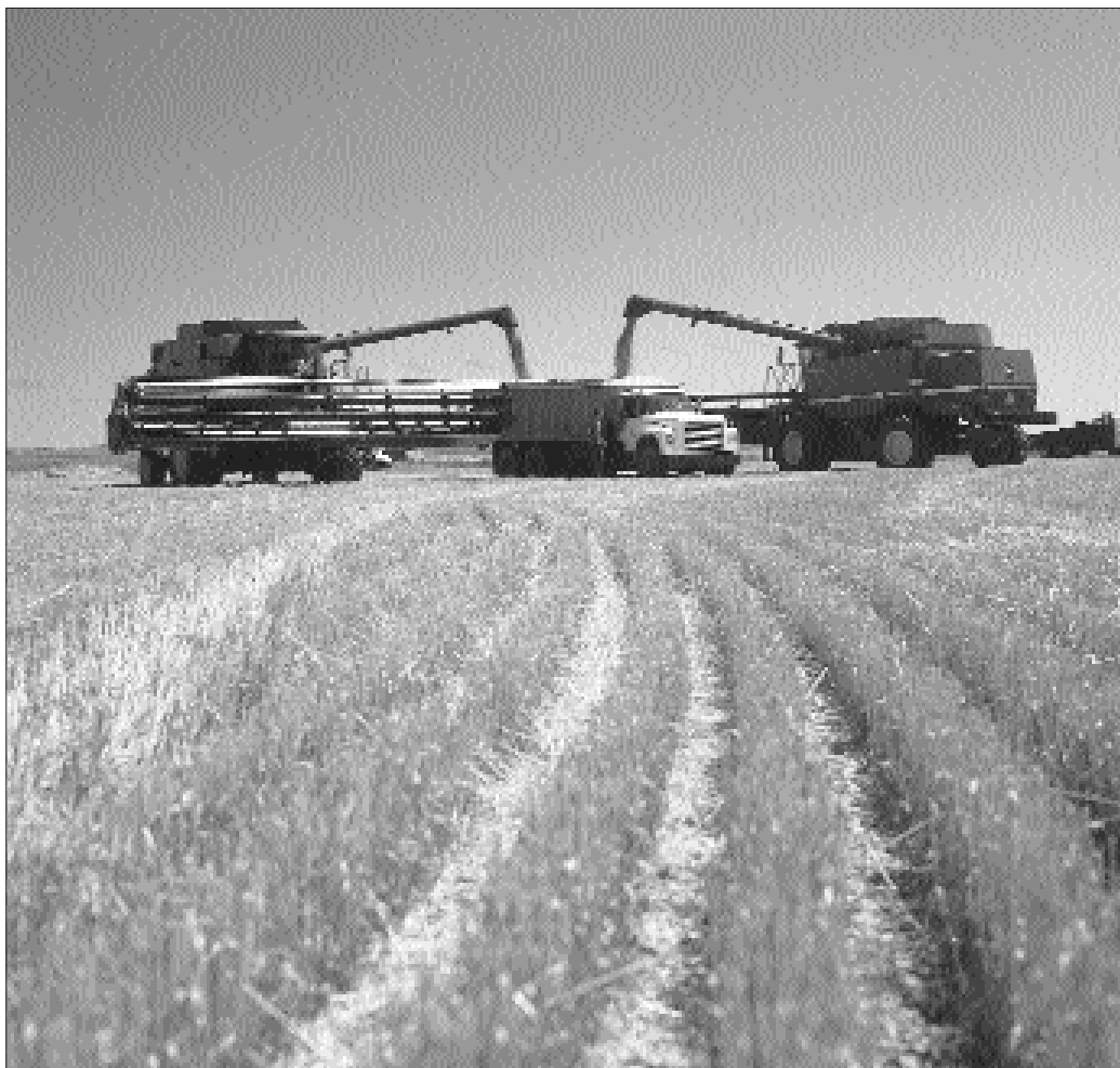
Massive combines fill waiting trucks with golden cargo. Leebrick farm, Rawlins County, 1998.

the livelihood of the richest family in town from oil to grain. Logan shot several scenes in and around Hutchinson elevators, grain gushing everywhere. And the camera takes the climb to the top, the cabin of the elevator, for a panoramic view of the rich central Kansas landscape. Logan knew exactly what he wanted to project as the heart of Kansas in what was only the second film ever to be made in the state. And after being in the cabin of a plane, looking out over harvest, I understand his impulse.