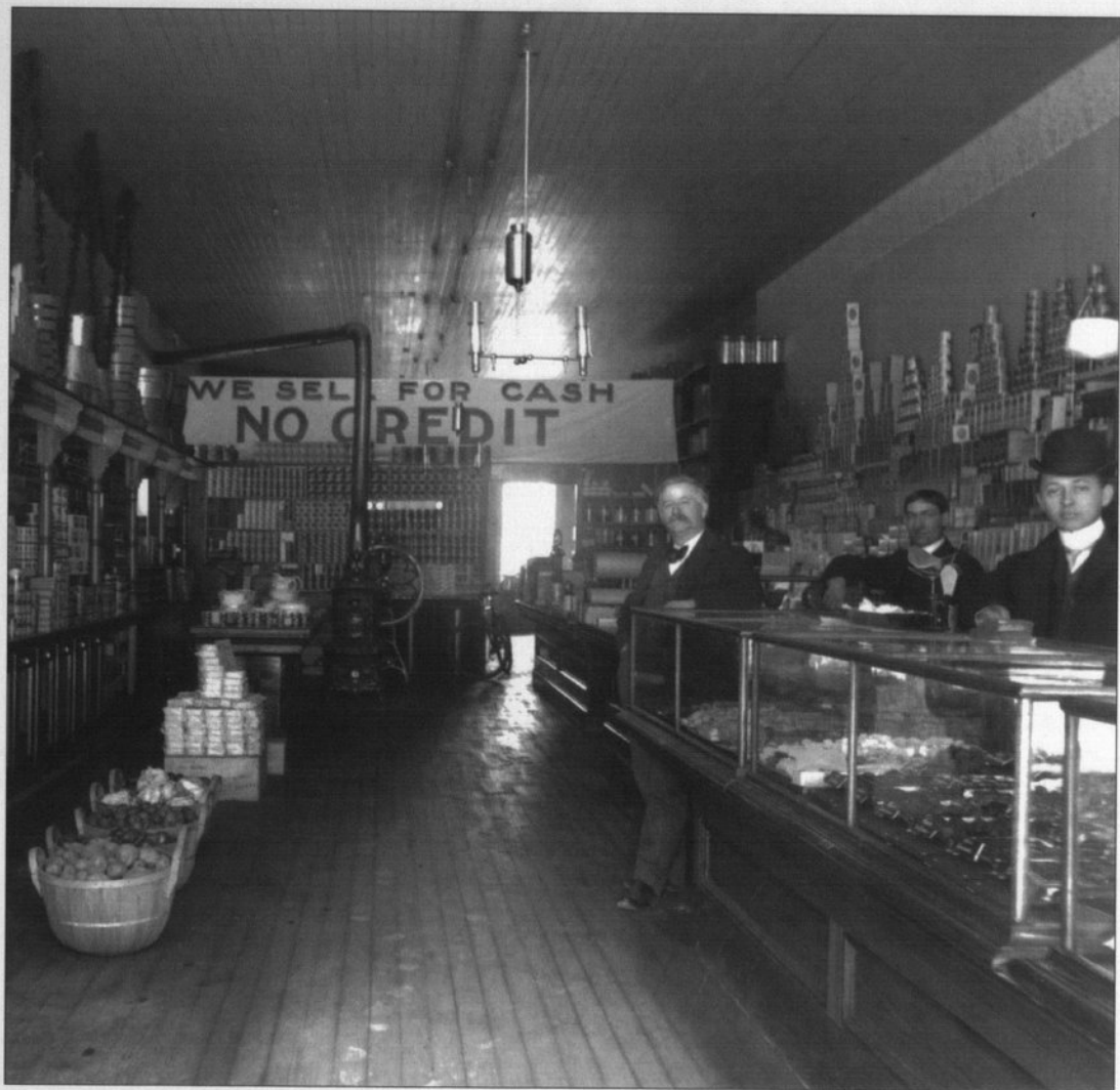
The Latham Cash Grocery, Junction City, 1901

Bearing little resemblance to the suburban "super store" of today, the well-stocked grocery of the turn of the past century was nevertheless a vital fixture in any well-appointed downtown commercial district. Junction City actually boasted several such general merchandise and grocery establishments along Washington Street, the city's main business artery. Nearby stood banks, bakeries, barber shops, butcher shops, clothing stores, confectionary stores, hardware and implement dealers, a furniture and undertaking business, hotels, and restaurants, as well as dentists, druggists, physicians, and much more in the city's business core.