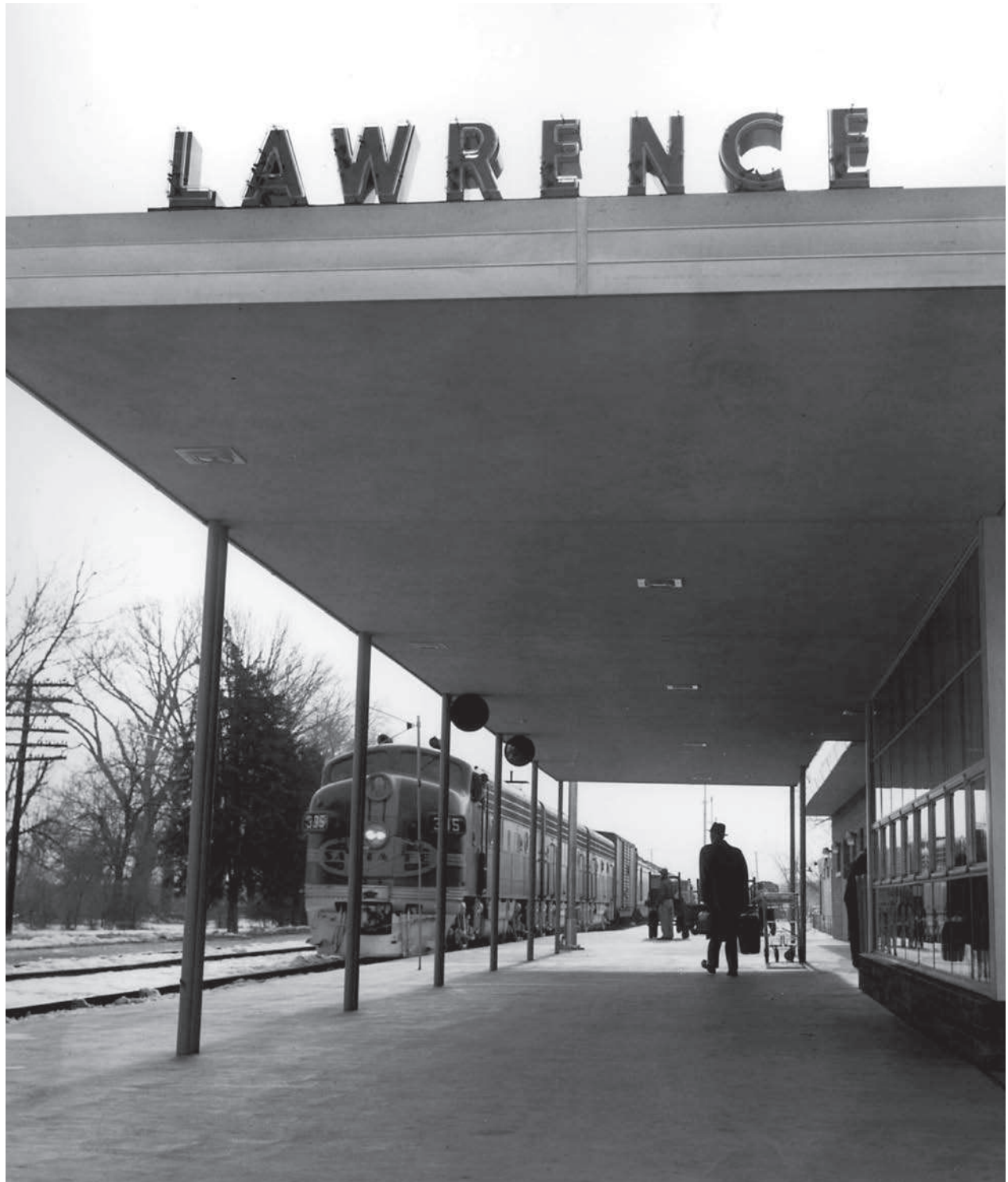
Kansas History: A Journal of the Central Plains 33 (Spring 2010): 22–41