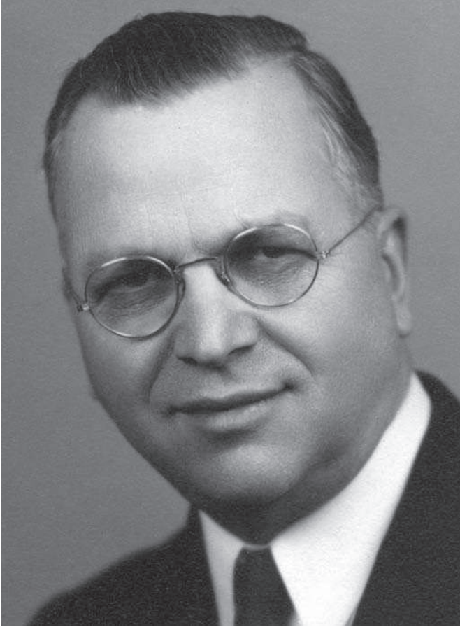
Edwin F. Abels, the conservative editor of the Lawrence Outlook and representative to the state legislature from 1937 until 1948, was among the most vocal and intransigent critics of the civil rights movement. Abels was a perennial critic of efforts to foist social change upon a resistant population, and he used his newspaper to voice his opinion that prejudice could only be eroded gradually, "like the weathering of a block of granite where the change made through a century is almost imperceptible."

to violence. Just months after the war ended, a mob invaded the home of one of the town's black residents and, while one intruder held a cocked pistol to the owner's temple, the others plundered and demolished his home. 6 Whites grew more aggressive after the Exoduster movement, which brought thousands of southern blacks to Kansas in 1879 and swelled the black population of Lawrence from about 17 percent of the total in 1870 to approximately 23 percent by the next census. Responding to this influx, whites threatened to lynch black prisoners in four separate incidents between 1879 and 1883. "The death penalty . . . or lynch law, are believed to be the only