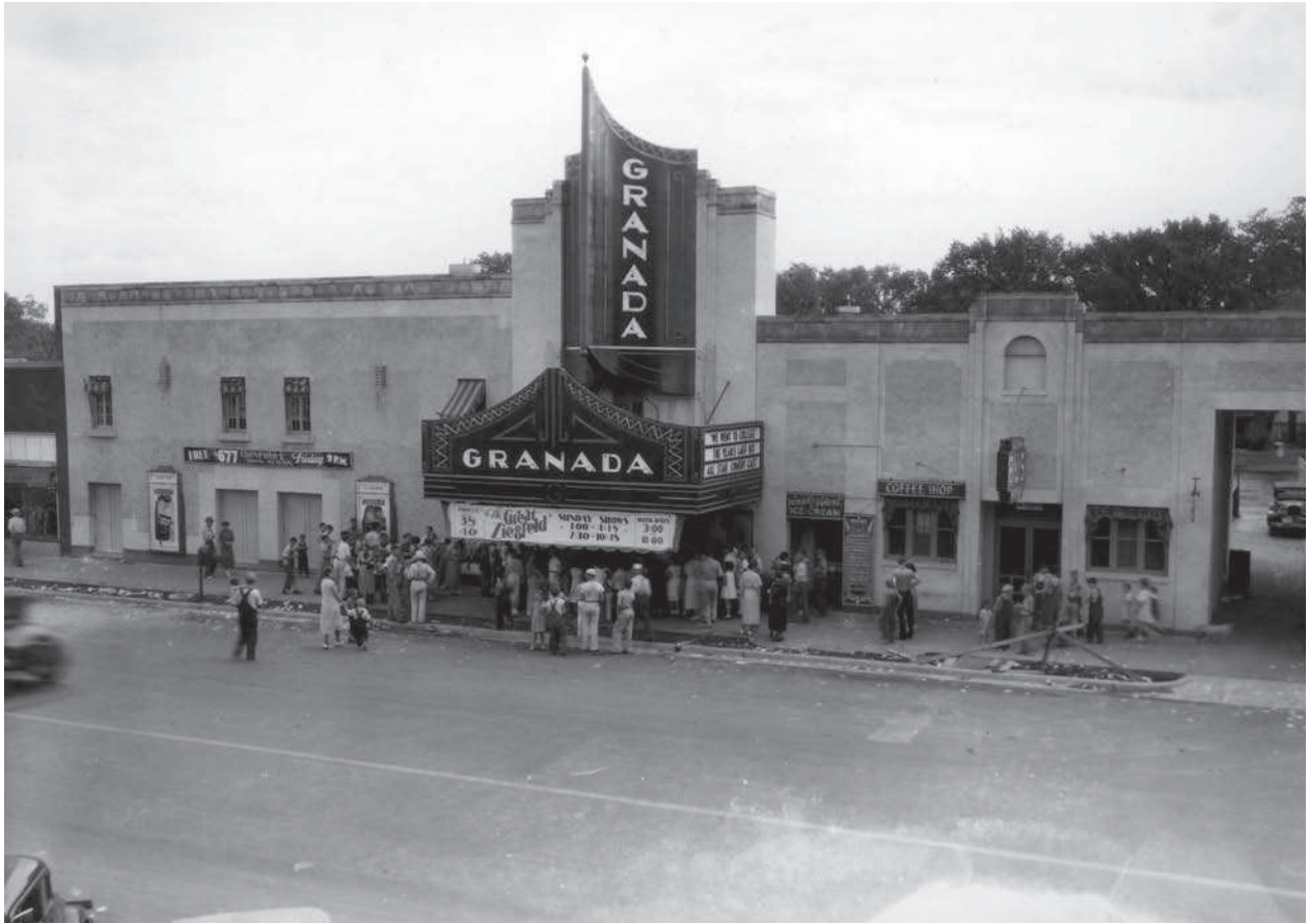
A crowd gathers at the Granada Theater in September 1936 to take in a matinee. By World War II, the town's white residents enforced segregation in movie theaters, restaurants, pools, and bowling alleys, among other places, making such venues in Lawrence racial trouble spots. Local blacks knew where they could and could not go; whites, however, did not shy away from drawing the color line explicitly for newcomers as circumstances warranted. At the Granada in the summer of 1944, for example, two black couples were barred from seeing a film and sent away "with a great deal of unpleasantness."

expressing his view that white supremacy was ordained by the highest of powers. "What do you mean?" he asked, arguing that "God made both races—was he immoral?" 22 Increasingly, however, local conservative leaders were becoming much more circumspect about expressing such views in public forums. They seemed to understand the serious concerns articulated by national leaders over, first, the incongruity between the country's opposition to fascism and communism abroad and its tolerance of white supremacy at home and, second, the potential impact of blatant racism on American claims to leadership among the peoples of Africa, Asia, and Latin America. Undoubtedly, whites continued to employ flagrantly racist rhetoric in their daily lives. In 1947 a businessman, railing against civil rights activists,