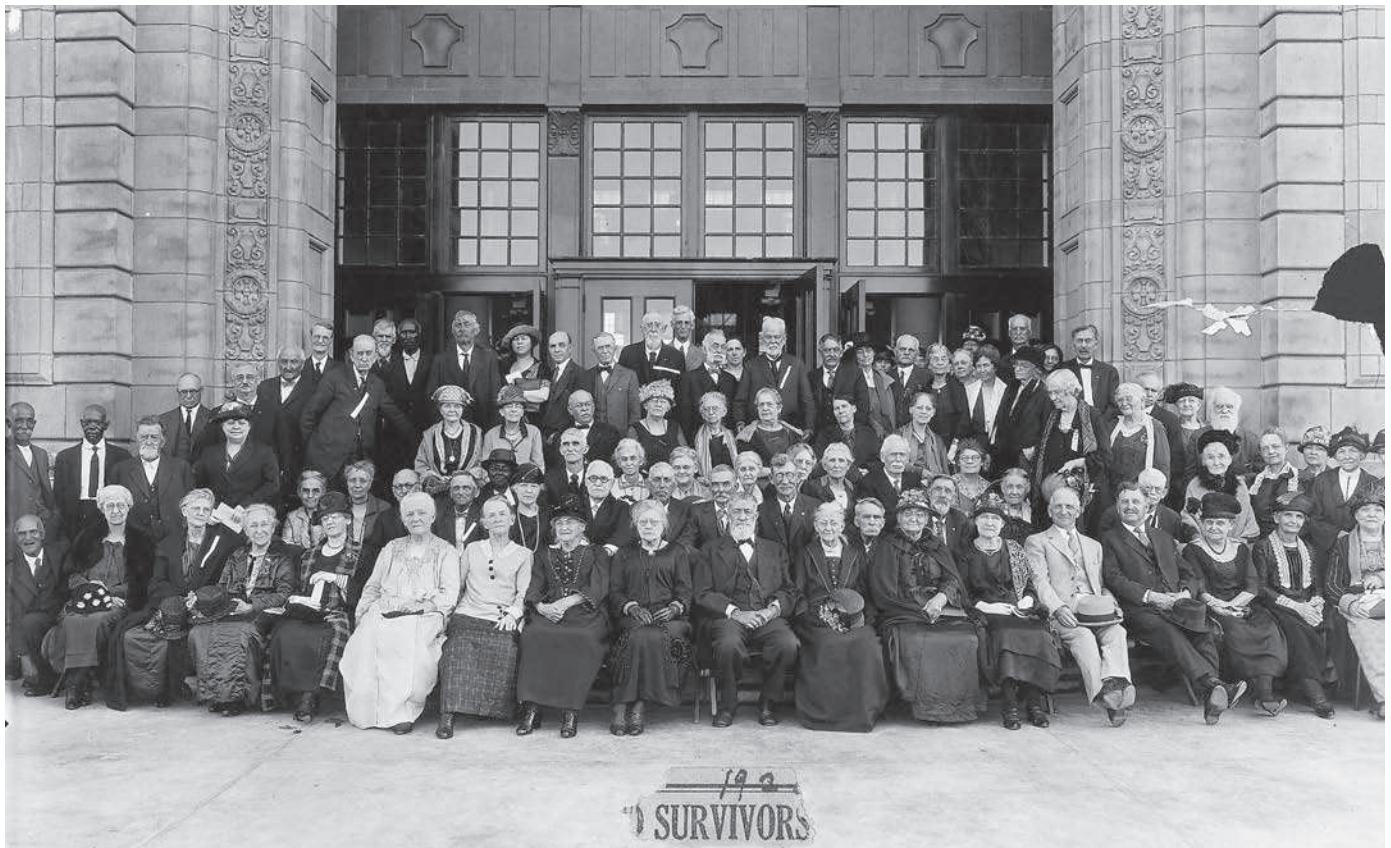
After the Civil War, white Kansans created a free-state narrative that cast their state—and themselves—as staunchly committed to racial equality. Those in Lawrence, the territorial hotbed of abolitionism, subscribed to this narrative with particular fervor, fusing it with the story of the 1863 sacking of their town by William Clarke Quantrill. Survivors of the raid, photographed here at an April 1925 reunion outside Strong Hall at the University of Kansas in Lawrence, met to remember the deep legacy of the event sixty-two years after its occurrence.

housing, and employment. “Isn’t it a burning shame?” asked the Historic Times , the city’s black paper, in a report on the expansion of these practices in the 1890s. “Right here in the city of Lawrence, ‘the Athens of the West,’ ‘neath the eaves of the great State University, and mid churches that preach ‘out of one blood God created all nations,’” white men were permitted to “defile the good name of the fairest city in the West.” Over subsequent decades, whites consolidated Jim Crow. A longtime resident later remembered that “a lot of the discrimination around here seems to have cropped up” in the years from “the early 1900s until about World War II.” 10 Although they did not invoke lynch law after 1882, whites continued to threaten it. In 1898, for example,