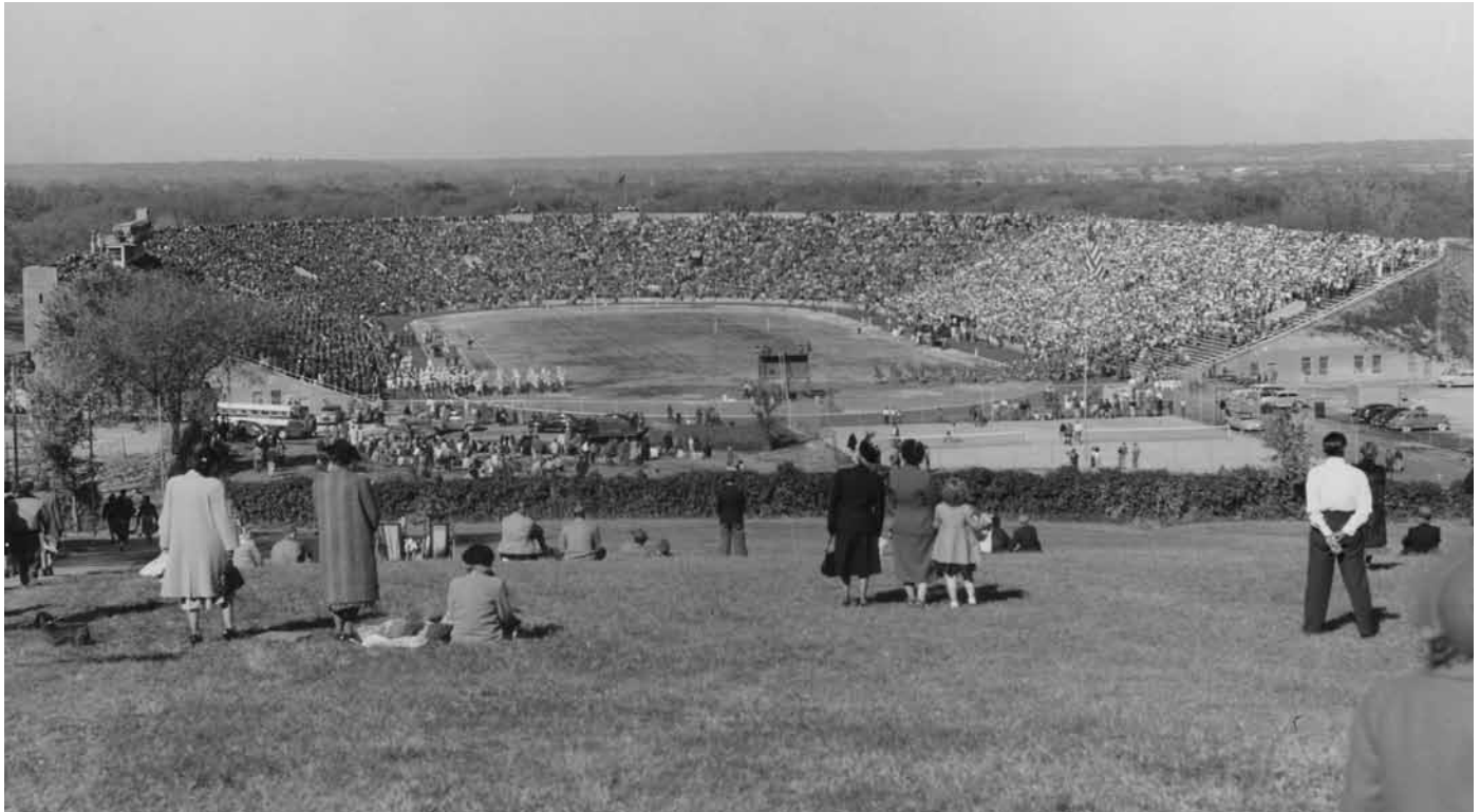
Although segregation was pervasive at the University of Kansas until World War II, Kansas nonetheless challenged discrimination in intercollegiate sports throughout the 1940s and 1950s by allowing African American student-athletes to play at Memorial Stadium, pictured here in the 1950s. While playing on the road, Kansas, like other Big Six and later Big Seven schools, generally complied with their southern opponents' ban on black college athletes.