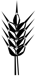
The Wheat State

Then think about your own hometown. Does it have a nickname or symbol? If not, can you come up with one? Draw a picture to illustrate your town's nickname or symbol.