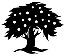
The State Tree is the Cottonwood