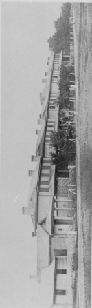
FORT HAYS—(Upper) Enlisted men's barracks, including kitchen and mess halls, about 1873. (Lower) Officers' quarters, probably after 1880.