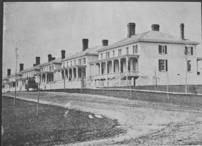
FORT LEAVENWORTH—Officers' quarters in 1872.