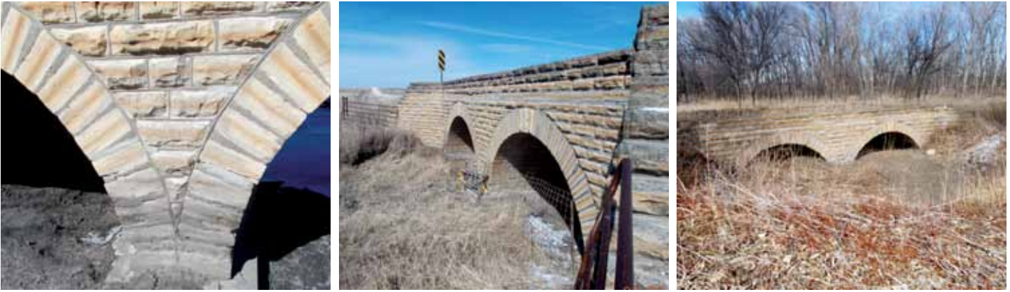
Left to right, Brown's Creek Tributary Masonry Arch Bridge, Mitchell County; Antelope Creek Masonry Arch Bridge, Mitchell County; North Rock Creek Masonry Arch Bridge, Mitchell County.

Three historic limestone bridges in Mitchell County were nominated for their local significance in the areas of government, social history, and engineering. They were constructed with locally quarried limestone between 1936 and 1940 as part of the Works Progress Administration (later named the Work Projects Administration), a federal New Deal-era work relief program that employed local residents. The Brown's Creek Tributary Masonry Arch Bridge, a triple-arch limestone structure, is located on a rural county road northeast of Glen Elder in Mitchell County. The double-arch Antelope Creek Masonry Arch Bridge is located on a rural county road northeast of Tipton in Mitchell County. The North Rock Creek Masonry Arch Bridge, a double-arch structure is located on a rural county road northeast of Hunter in Mitchell County. The bridges were nominated as part of the New Deal-era Resources of Kansas and Masonry Arch Bridges of Kansas multiple property nominations.