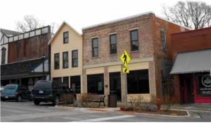
Seybold Building, Douglas County

residential, commercial, and public development in Lawrence in the three decades after World War II. Property types covered by this context include commercial buildings, education-related buildings, and residences exhibiting Minimal Traditional, Ranch, Split-level, and Contemporary styles. No properties were nominated as part of this proposal. This project was funded in partnership between the Kansas Historical Society and the City of Lawrence.