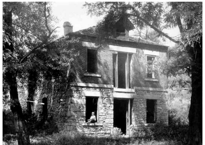
Top, this building served as a residence as well as a bar room, with a brewery in the back, photographed in 1956 (bottom).