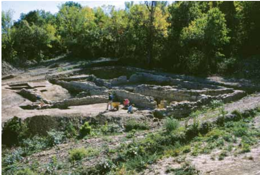
Excavations in 1987 by archeologist Larry Schmits were conducted to salvage the remains of Quindaro from the landfill planned for this area.

currents, the advent of Kansas statehood, and the onset of the Civil War brought community growth to an abrupt end. By the mid-1860s the commercial heart of the town was all but abandoned, and the population dwindled. The boom had very rapidly gone bust.