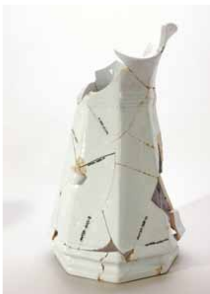
Partially reconstructed serving pieces from the Quindaro site: chamber pot (above) pitcher (below).

Historical research, testing, and excavation were carried out between 1984 and 1988.