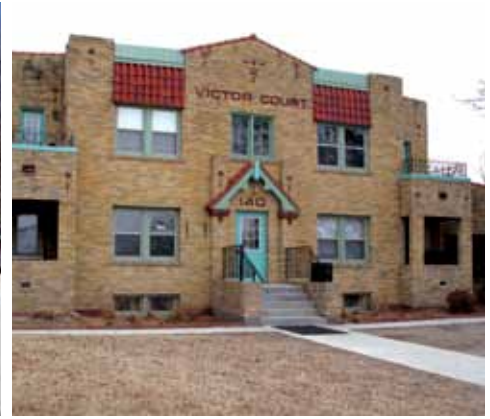
Left to right, First Presbyterian Church of De Graff, Butler County; Lincoln School, Doniphan County; Victor Court Apartments, Sedgwick County.

gathering spaces, and double-loaded corridors lined with guest rooms (now apartment units). The building operated as Kansas City, Kansas' largest downtown hotel from 1951 until it was converted to residential apartments in 1978. It was nominated for its local significance in the areas of commerce and architecture.