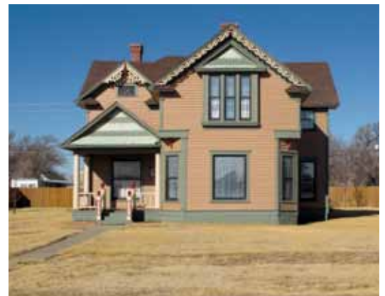
Left to right, First Congregational Church, Harper County; John Moyle Building, Butler County; W.B. and Julia Washington House; Wichita County.