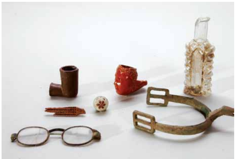
Right, personal items recovered from archeological excavations at Quindaro.

In the early 1980s, when Browning-Ferris Industries (BFI) of Kansas City, Kansas, began implementing plans to construct a sanitary landfill on the site of Quindaro, the descendent community in the surrounding neighborhoods sounded the alarm. Convinced of the historical significance of Quindaro, several local groups sprang into action in an attempt to preserve the site. As community activists worked to halt development, Environmental Systems, Inc., the archeologists employed by BFI, began excavating the ruins in an attempt to salvage information about Quindaro before it was buried.