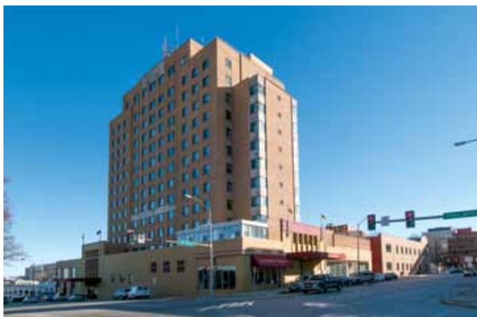
Top to bottom, Baxter Springs High School, Cherokee County; Town House Hotel, Wyandotte County.