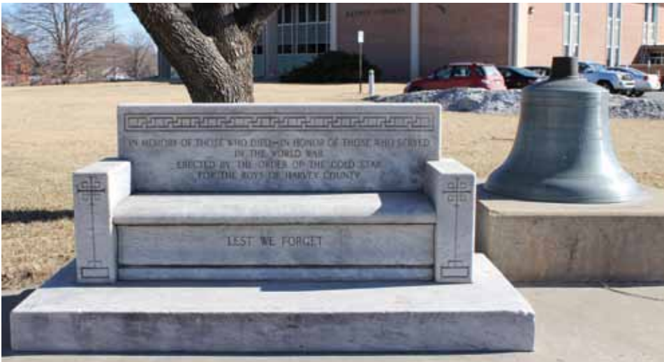
World War I bench on the lawn of the Harvey County Courthouse, Newton.