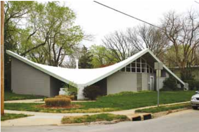
Double Hyperbolic Paraboloid House, Lawrence, Douglas County.

The document's four original contexts, which are arranged chronologically, are "Settlement Period, 1854-1863"; "City-Building Period, 1864-1873"; "Agriculture and Manufacturing, Foundations of Stability, 1874-1899"; and "Quiet University Town, 1900-1945." The original document identifies two property types—residences and commercial buildings of various architectural styles. The new context is intended to bring up-to-date the original document with discussion of