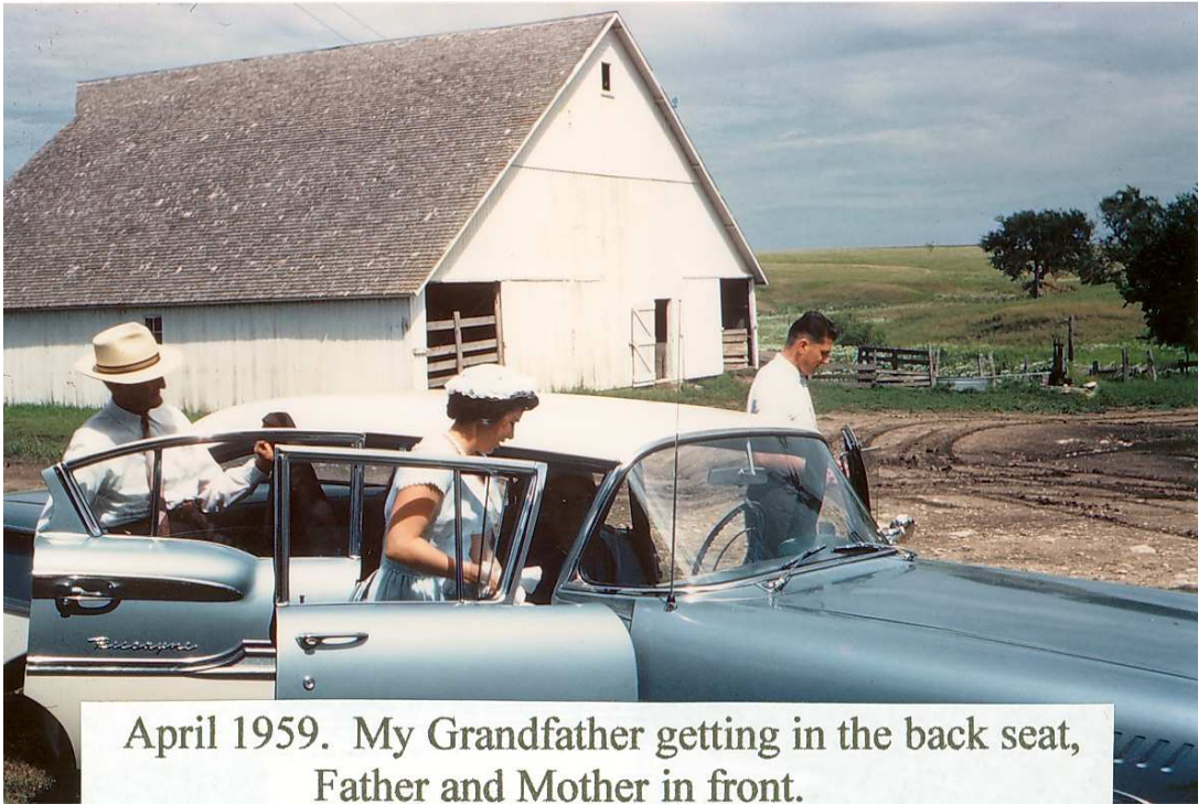
April 1959. My Grandfather getting in the back seat, Father and Mother in front.

Section number Add'l Documentation Page 10