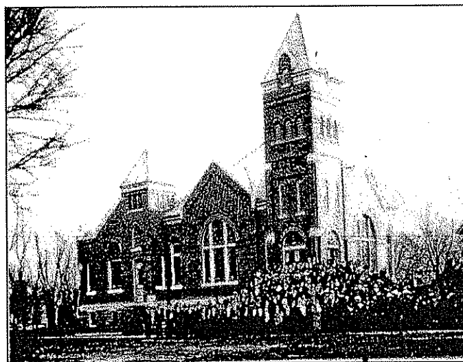
Burr Oak United Methodist Church, 1912.