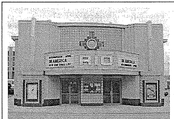
Rio Theater Originally Known as the Overland Theater

The Overland Theater's primary (south) façade has a symmetrical, streamlined, Moderne Style that features a veneer of peach-colored porcelain ceramic tile, neon lighting, aluminum trim, and glass block. The building has three distinct bays defined by a recessed central core flanked by projecting stepped end bays. A band of corrugated aluminum runs horizontally across the façade at the roofline and above the entrance, separating the first and second stories. The upper story of the center bay features a wall of glass block punctuated by an oculus with stylized projecting rays of neon tube lighting. This design motif lends the theater a southwestern feel. A neon clock currently fills the oculus. Below the glass block is a projecting semi-hexagonal marquee that shelters the theater entrance. The banded marquee