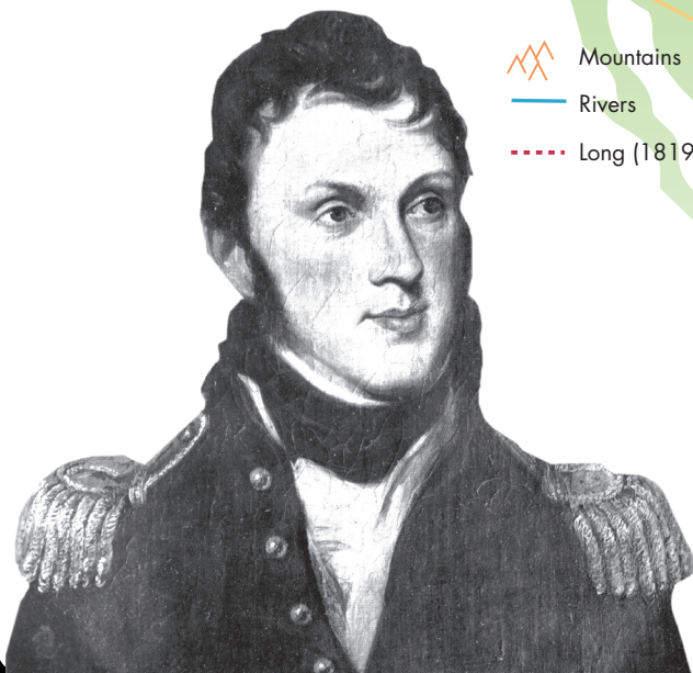
Major Stephen Long's exploration route, 1819-1820.